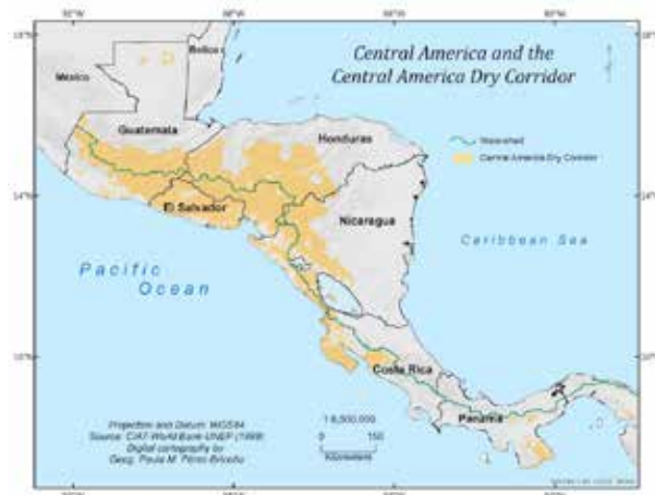
Figure 1. The CADC defined by drought risk

The delineation of the CADC varies from study to study. One often cited definition is based on the Climate Risk Index as applied by (Centro Internacional de Agricultura Tropical [CIAT]-World Bank and United Nations Environmental Programme [UNEP] (1999). It includes those areas on the isthmus that exhibit a dry season of at least four months in duration, as depicted in Figure 1.